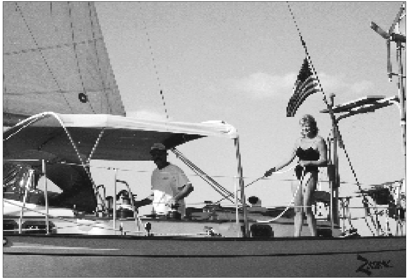
The semi-permanent bimini over the center cockpit, attached at the aft end to the boom gallows, provides plenty of sun protection. The nicely bowed dodger is strong enough to stand up to bad weather and keeps spray and rain out of the companionway. The Windbugger, solar panels and antennas are mounted on the simple arch on the afterdeck.

staysail/spinnaker. On the mast are three No. 22s for main and two genoa halyards, a No. 16 for the staysail halyard and a No. 16 on the boom for reefing. We've now added a dedicated roller-furling self-tailing winch.