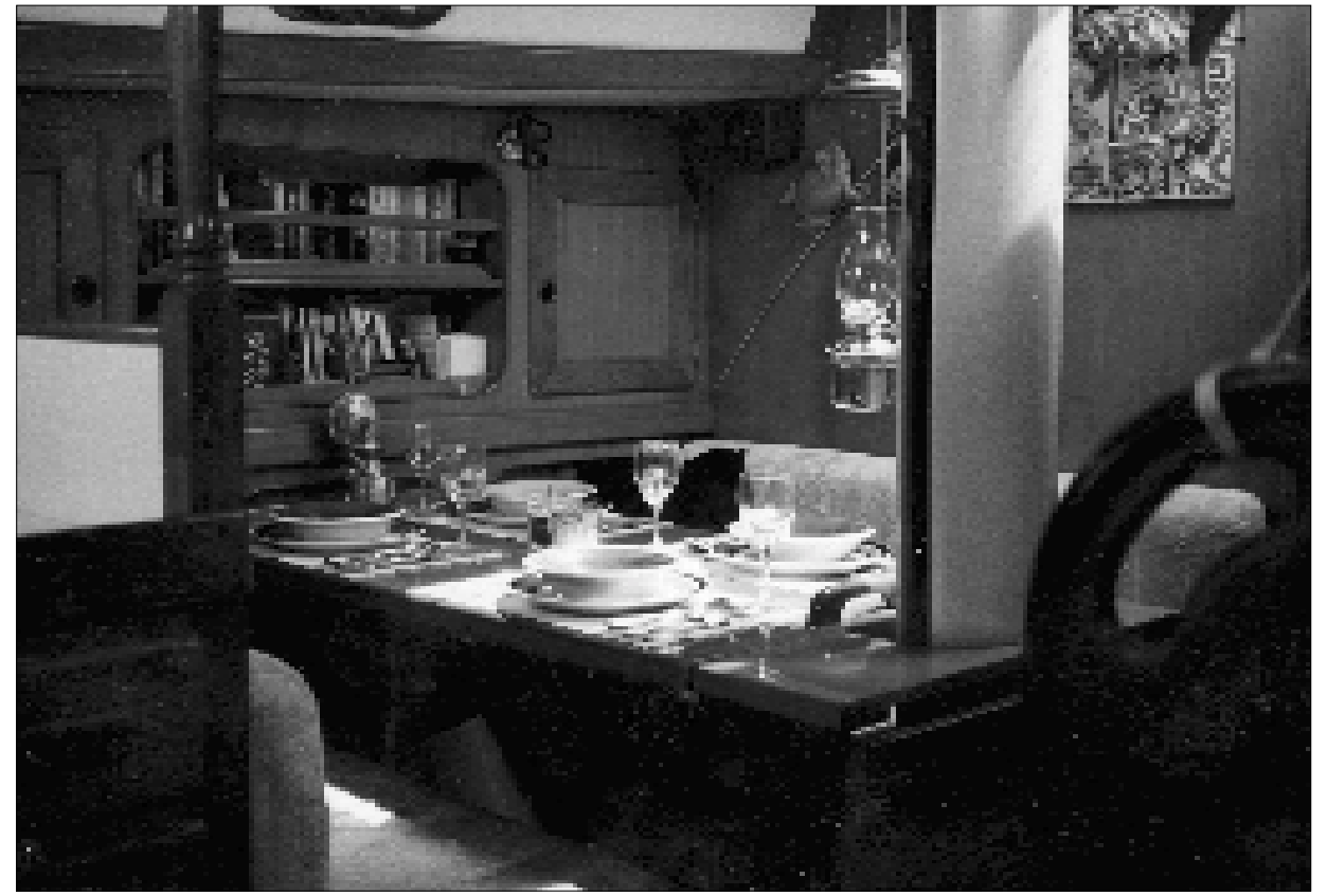
The P-44's main saloon is, unfortunately, dominated by the presence of the mast running right through the dinette table. But it's a "feature" you get used to that provides a good handhold in rough weather and a good place to fix a kerosene lamp. Across the way, the starboard settee makes a great seaberth.

Tankage for water is under the cabin sole in four s.s. tanks totaling 125 gallons. These tanks have been known to leak, so be sure to inspect them. The fuel tanks were originally steel and also have caused problems; on Zorana , we just had the great fun of replacing them with nice new aluminum ones.