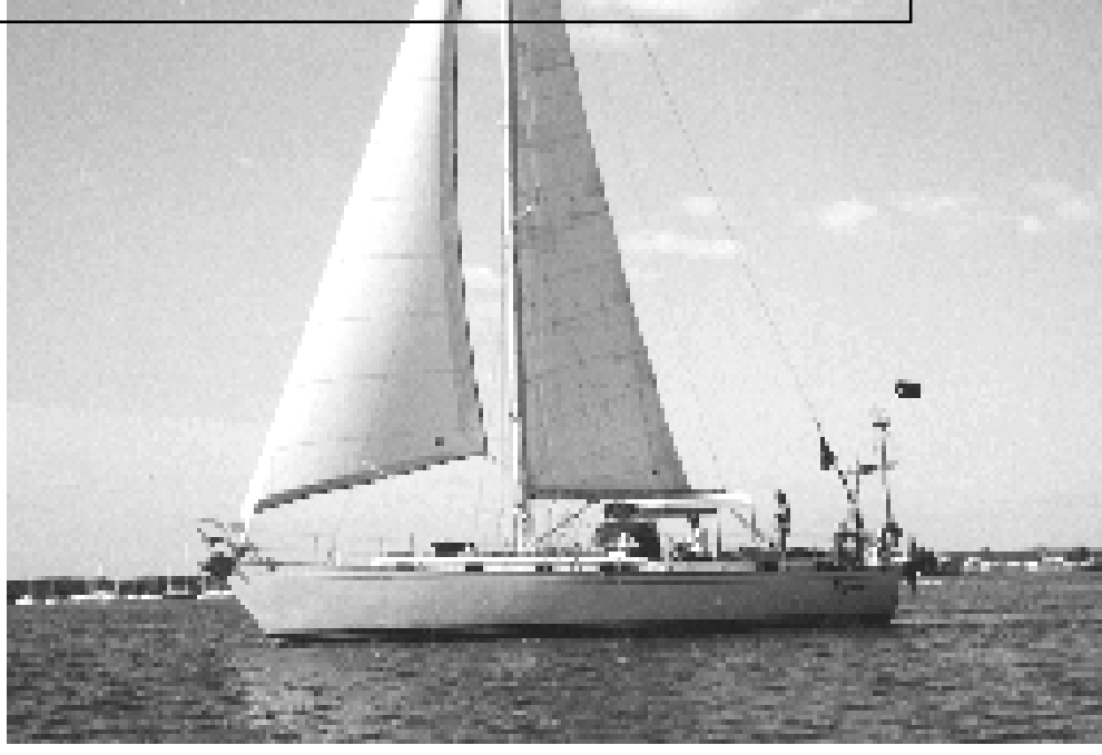
Designed by Doug Peterson and built in Taiwan by various builders, the P-44 embodies many attributes valued by long-range voyagers.

Rig: The cutter is great, simple, and efficient. It's tall enough to handle light airs and with a roller-furling headsail, sail area is easily reduced. The staysail