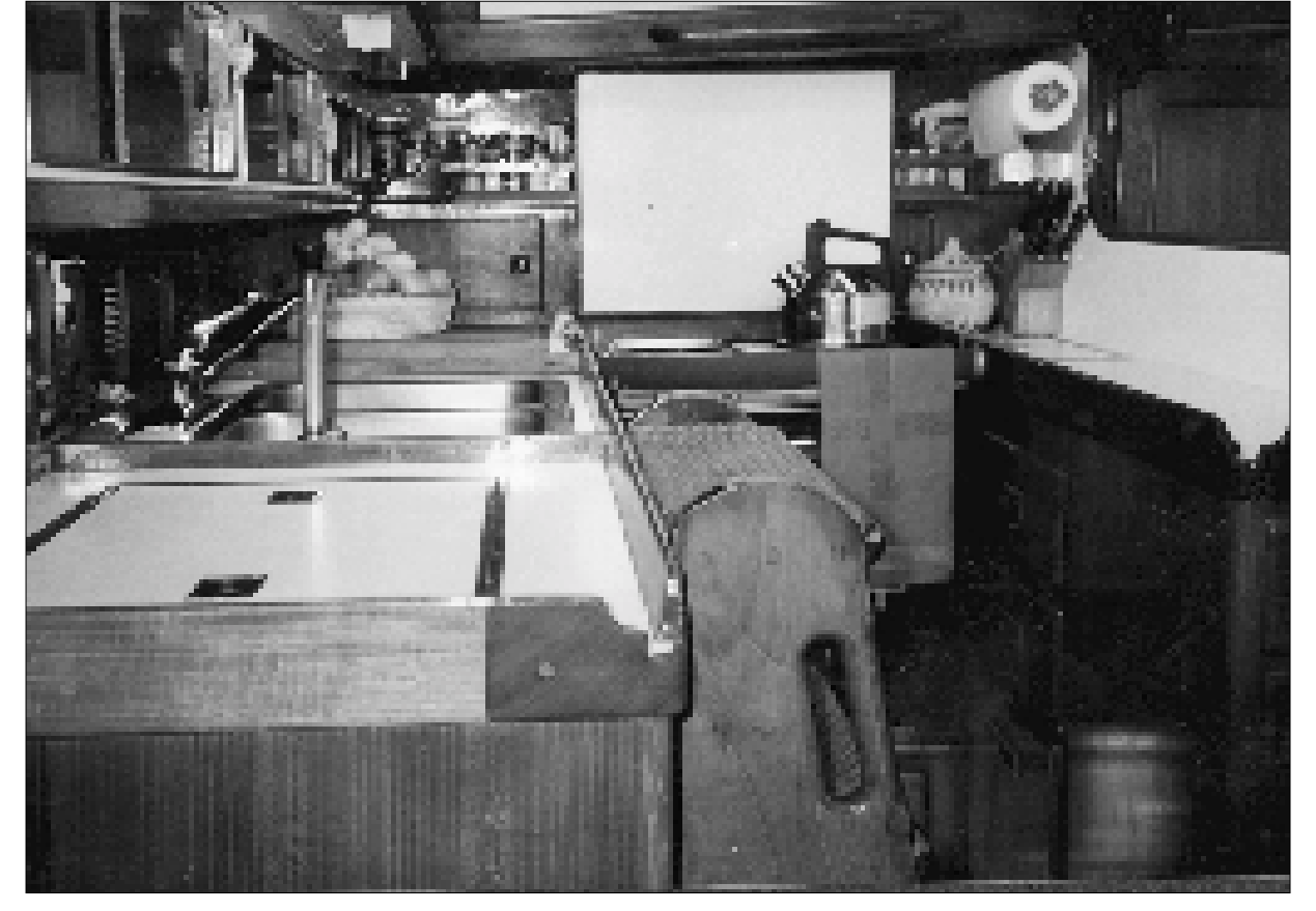
The P-44's galley is as good as you'll find on a boat of this size, with quite a lot of counter space and good access to the freezer box. The configuration shines at sea, when you want to be wedged into place. Ample storage space for cooking utensils, dishes, glasses and cutlery is provided in ready-made racks and the

coats of System 3 epoxy, barrier coat, and lots of bottom paint. We also pulled the rudder to check the heel-bearing bolts, which we replaced with bronze. Finishing up with an Imron topsides job, Zorana was set to go.