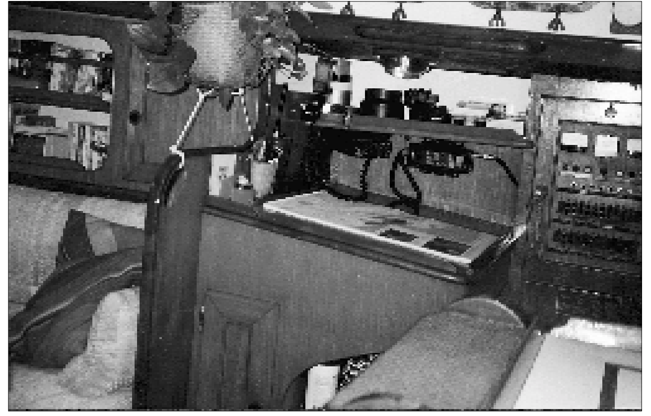
The chart table, to starboard as you descend the companionway, is large and comfortable. The table will take a chart folded in half. There is limited room above the table for electronics, particularly if you want a CRT radar, and not a lot of space for books, tables and guides. The main breaker panel is next to the navigator's seat.

After debating about how simple to keep Zorana, we opted to have sent down to Panama a pre-charged Technautique's refrigeration system. This system was easy to install, and now we had cold beer, wine, and the ability to freeze those big Mahi Mahi we were going to catch.