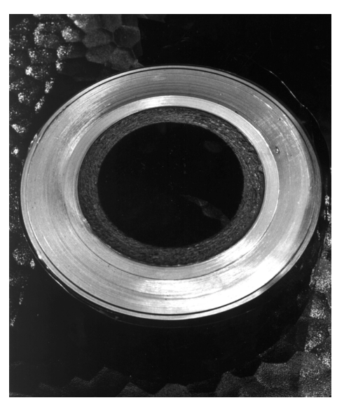
Use 3-inch wide, 3-mil copper foil to ensure a good sea water ground.

Same thing for a powerboat—but you'll need more ground foil because your automatic antenna tuner is probably mounted up top on the flying bridge. In this case, you will need to follow a wire run channel from the top of the flying bridge down below decks, and down to the bilge area where you can make connection to underwater through-hulls. You could even use a metal tube that may already be in place as part of your ground foil run.